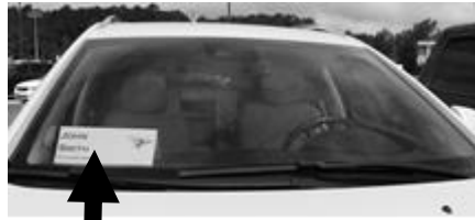
Sitting UP on the dash