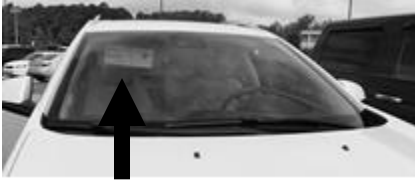
On visor with rubber band or clip

PLEASE DISPLAY YOUR CAR TAGS in one of these ways, so we can read the name(s). Thank you for your help with this.