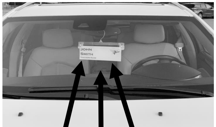
Hanging from rear view mirror with a pants hanger