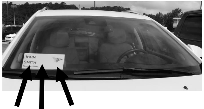
Sitting UP on the dash (passenger side)